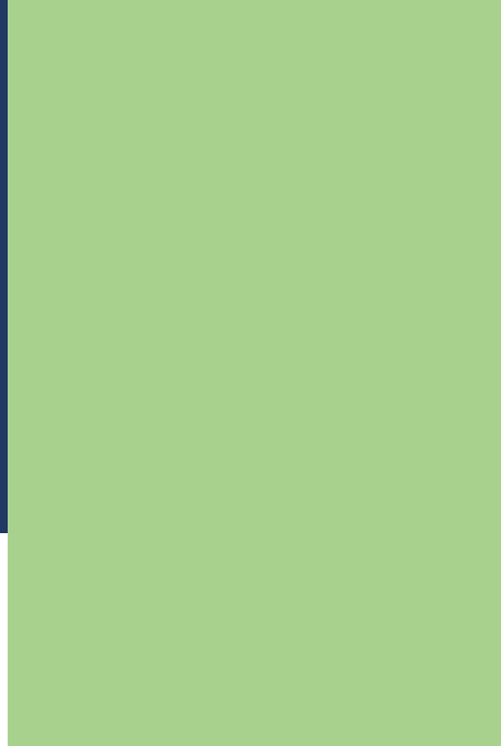
YOUR NAME Angel Investor