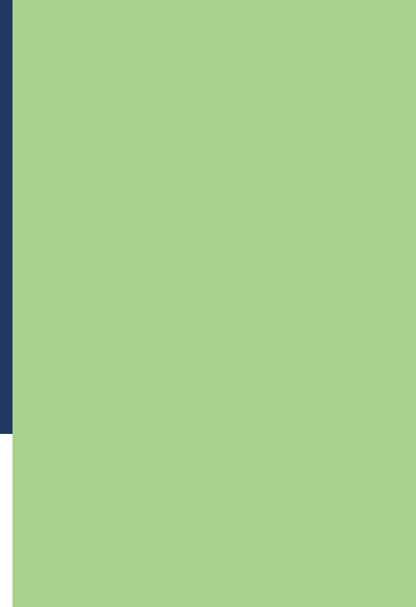
YOUR NAME Angel Investor