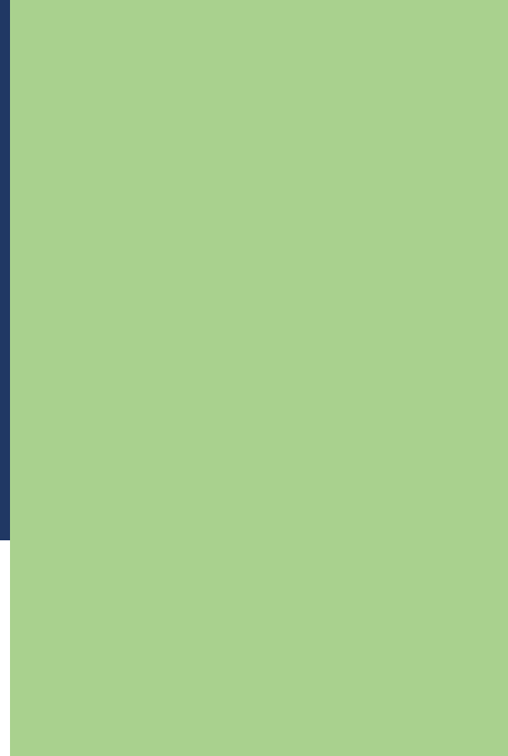
YOUR NAME Angel Investor